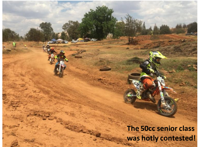
The 50cc senior class was hotly contested!