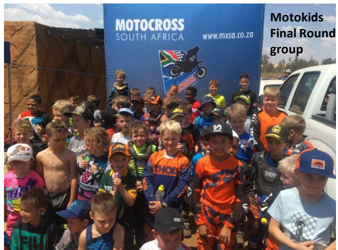
Motokids Final Round group