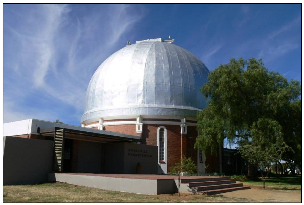
The Naval Hill Digital Planetarium.