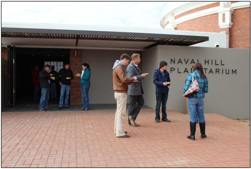
Everyone enjoyed the refreshments that were served after the intriguing discussions.