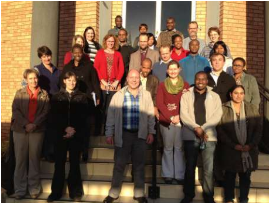
Integrating HIV and Gender Issues into Environmental Assessments Pretoria Course delegates