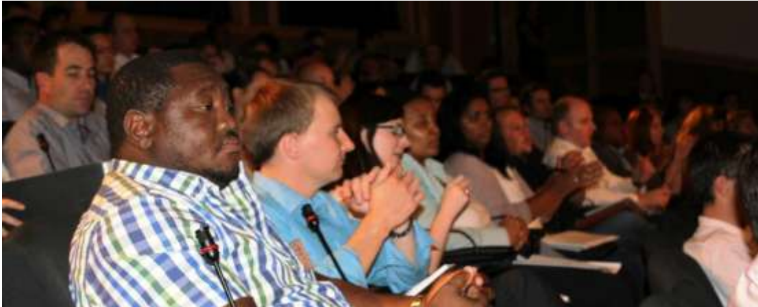
National Biodiversity Offsets Workshop at The Development Bank of Southern Africa (DBSA) on 15 – 16 July 2013