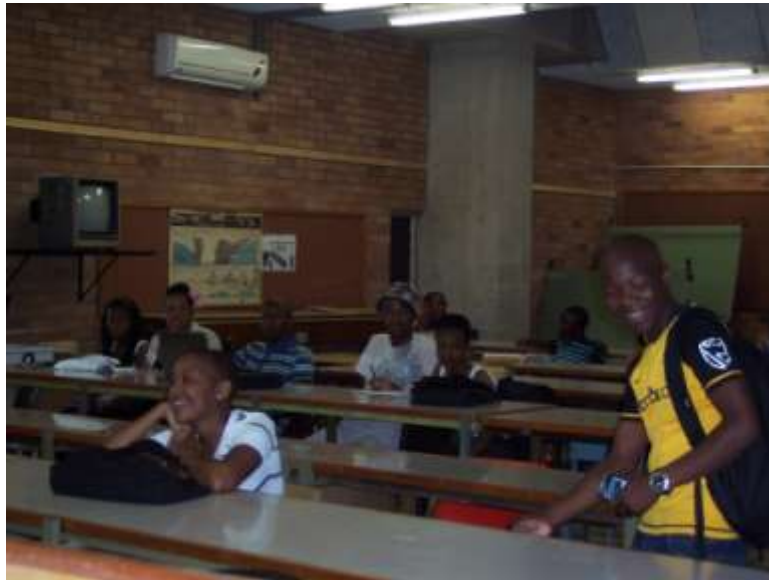
Workshop at University of Limpopo

Workshop with University of Limpopo students to provide them with information about IAIAAsa and to invite them to apply for membership.