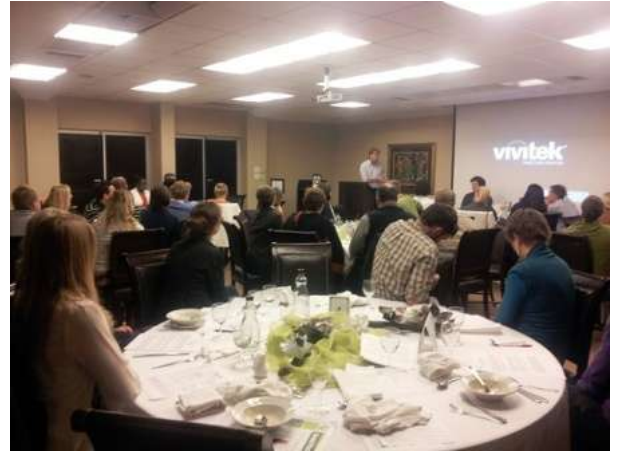
KwaZulu-Natal events 2012/2013