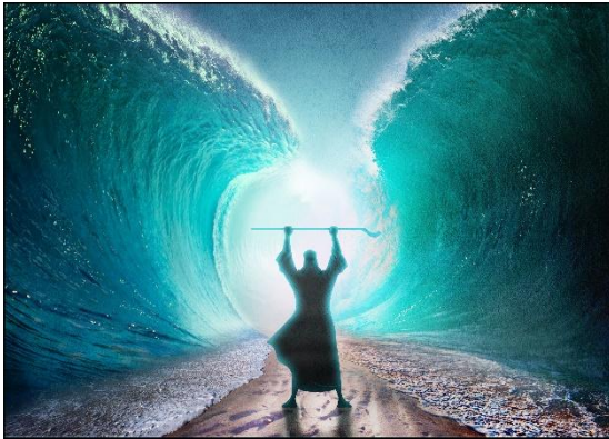
Moses's faith parted the Red Sea

Prayer is the foundation of our relationship with God. Through our prayers, in a true partnership of love, God can change this world for the better. It is our choice whether to be with God our Creator, who makes everything possible, and to ask him for assistance or to think we can do everything on our own and to suffer the consequences. Our Lord Jesus Christ keeps telling us that prayers are his only hope for this lost, chaotic world in turmoil.